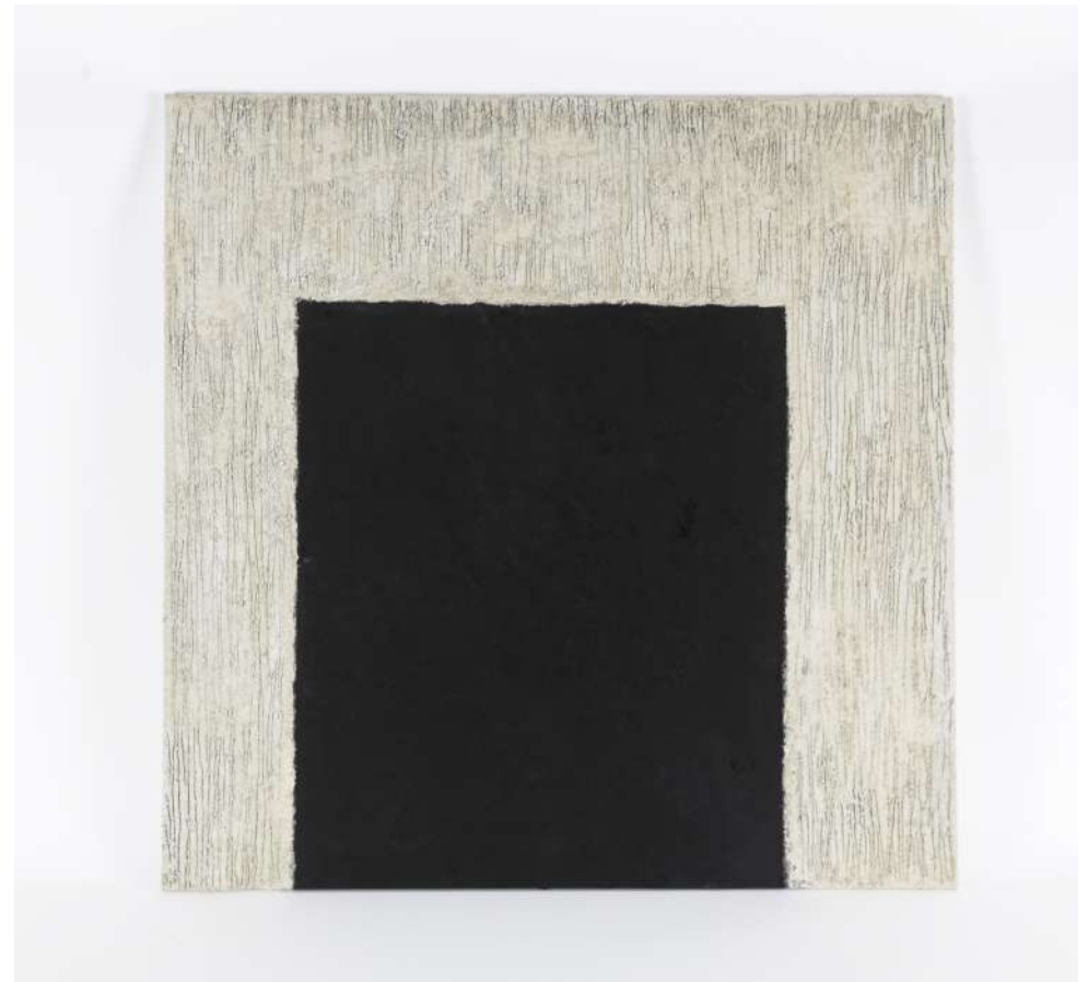
Hwado No. 11, 2024 Acrylic, Asian Paper, Sand, Modelling Paste, Glue on Canvas 102 × 102 cm (Unframed)