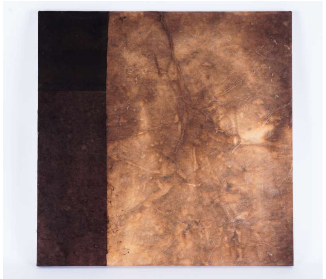
Hwado No. 14, 2024