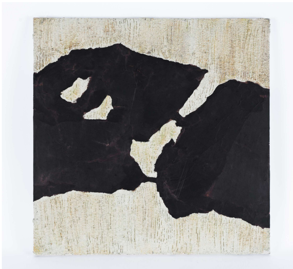
Hwado No. 1, 2024

Stain, Asian Paper, Sand, Modelling paste, Glue on Canvas