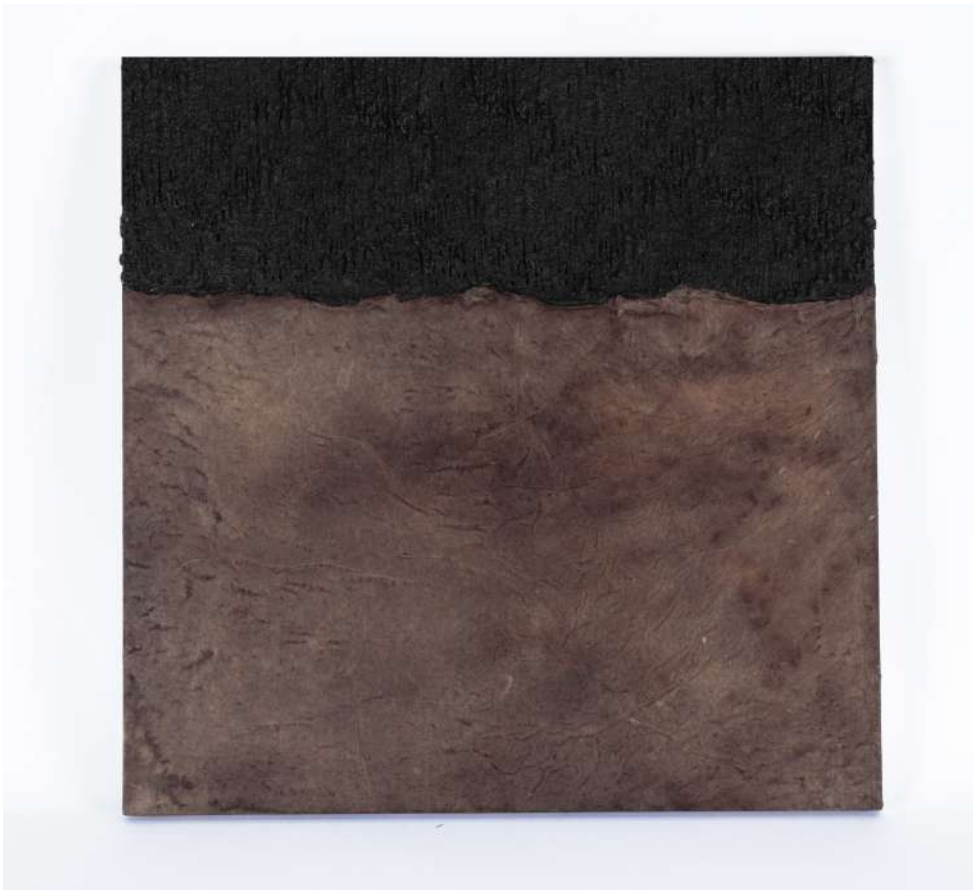
Hwado No. 9, 2024 Stain, Acrylic, Asian Paper, Sand, Modelling Paste, Glue on Canvas 61 × 61 cm (Unframed)