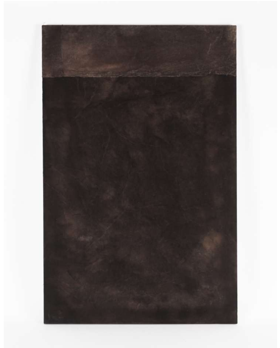
Hwado No. 8, 2024 Stain, Asian Paper, Glue on Canvas 102 x 66 cm (Unframed)