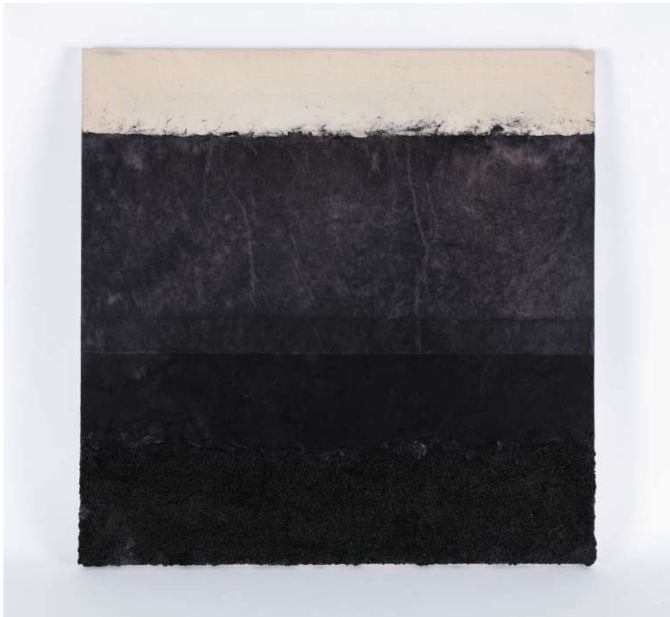
Hwado No. 12, 2024

Stain, Asian Paper, Sand, Modelling Paste, Glue on Canvas