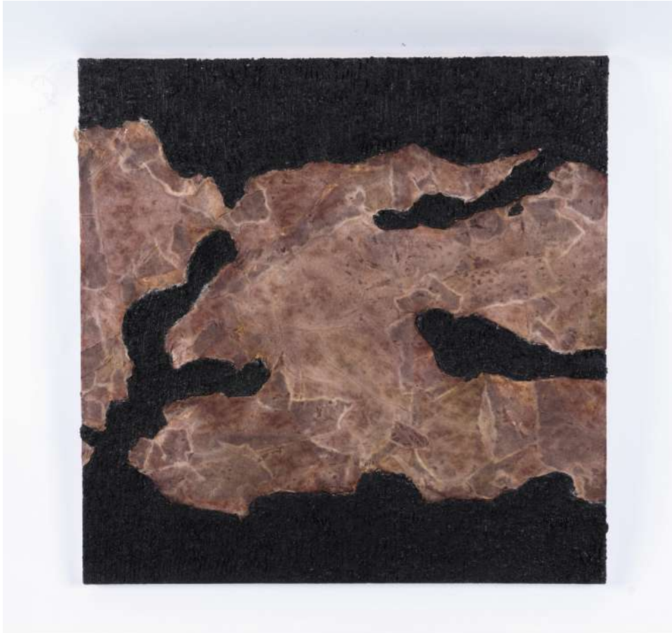
Hwado No. 5, 2024 Stain, Asian Paper, Sand, Modelling Paste, Glue on Canvas 56 x 56 cm (Unframed)