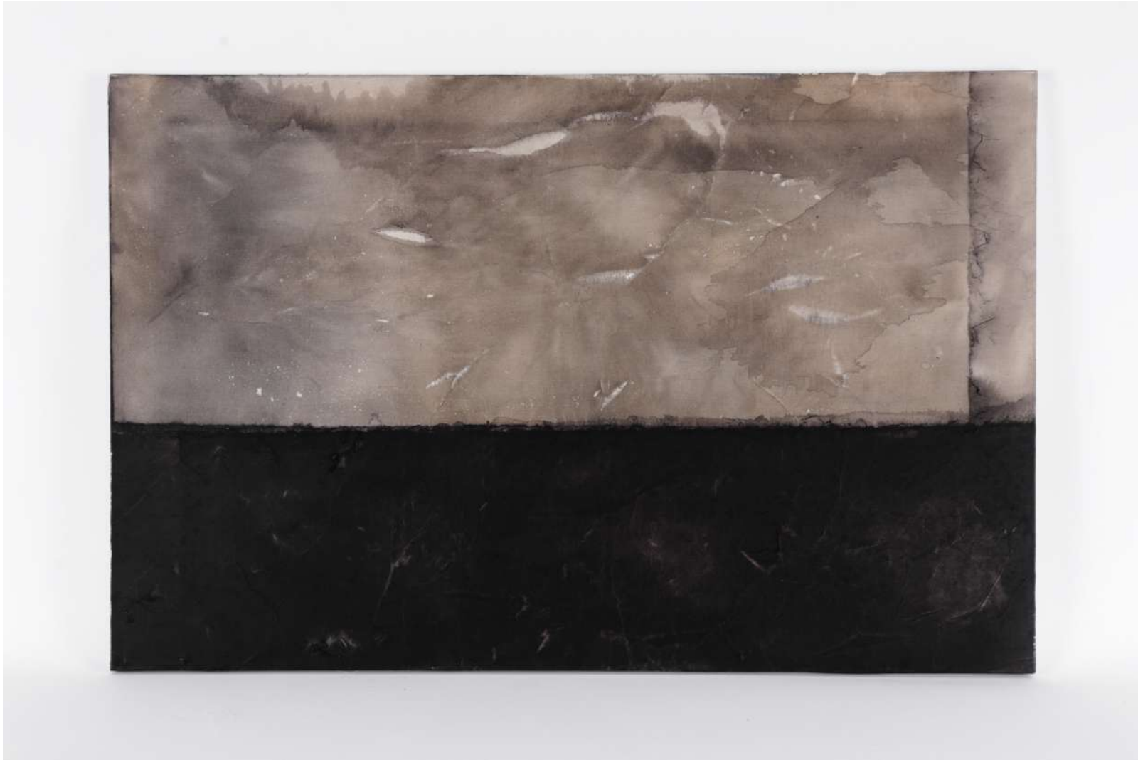
Hwado No. 10, 2024 Stain, Asian Paper, Glue on Canvas 66 x 102 cm (Unframed)