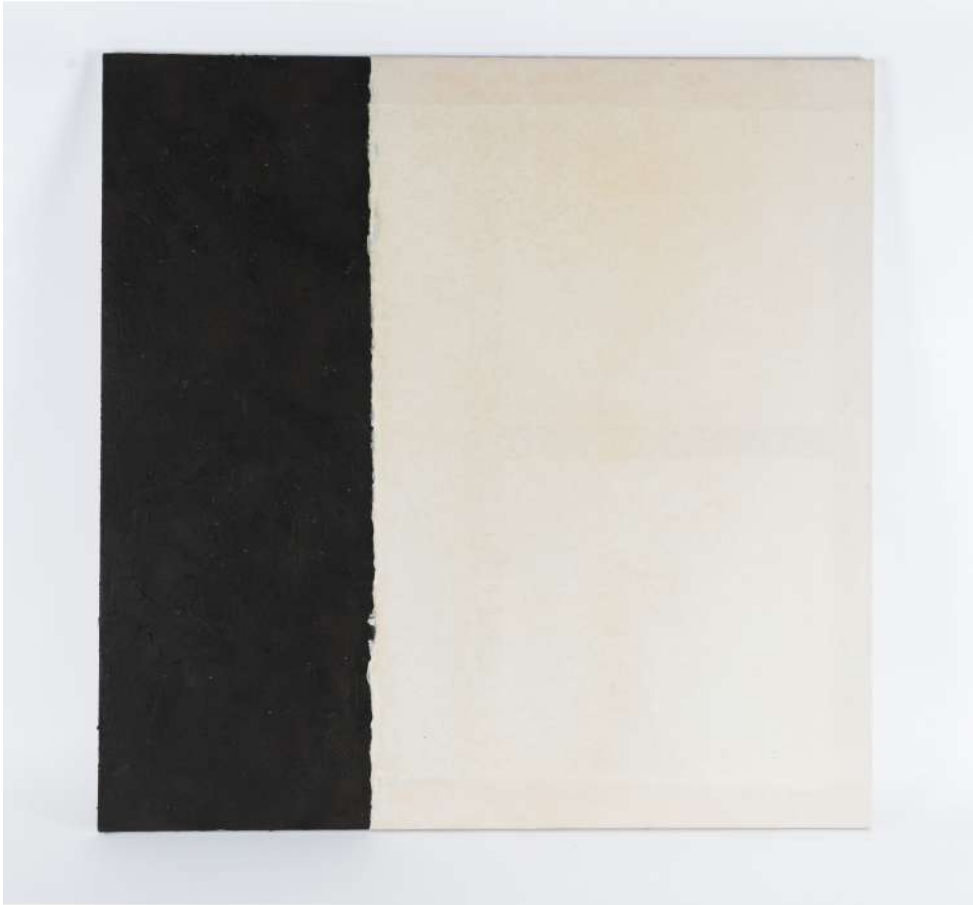
Hwado No. 3, 2024 Acrylic, Asian Paper, Sand, Modelling Paste, Glue on Canvas 102 × 102 cm (Unframed)