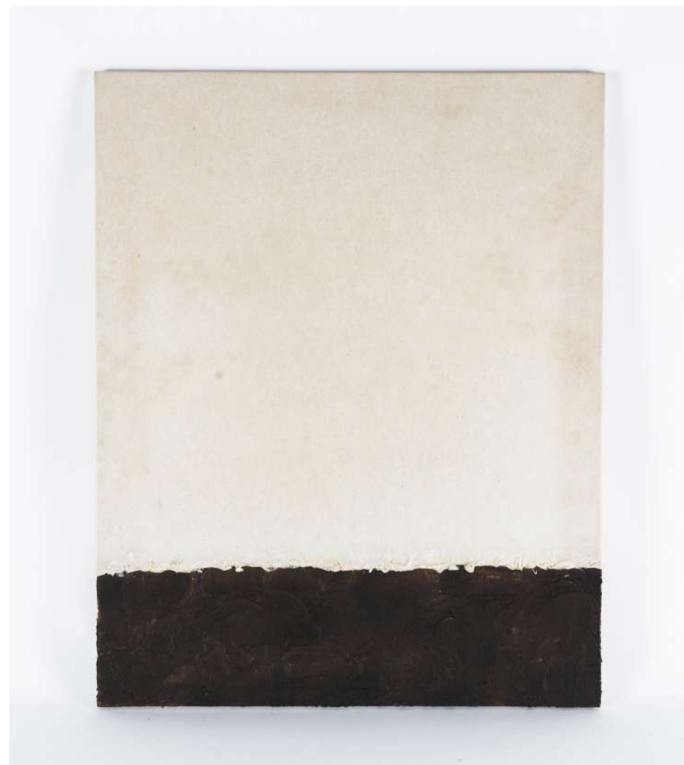
Hwado No. 2, 2024

Acrylic, Asian Paper, Sand, Modelling Paste, Glue on Canvas